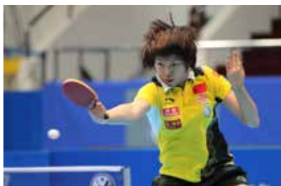
LI Xiaoxia (CHN) • No. 3