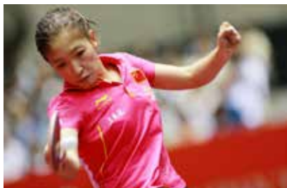
LIU SHIWEN (CHN) • No. 1