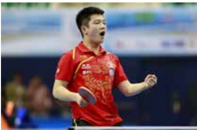
FAN Zhendong (CHN) • No. 3