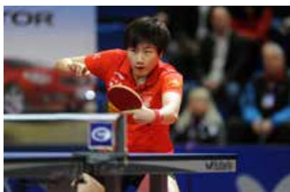
DING Ning (CHN) • No. 2